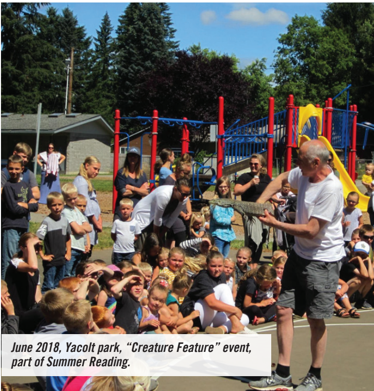
June 2018, Yacolt park, "Creature Feature" event, part of Summer Reading.