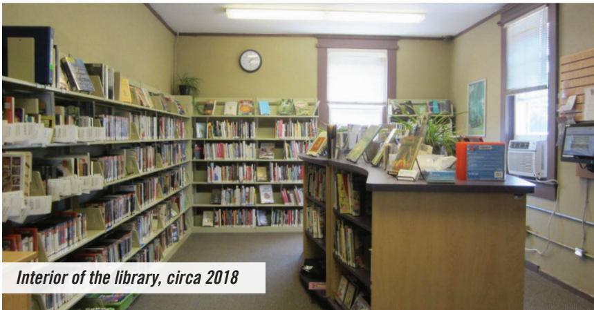
Interior of the library, circa 2018