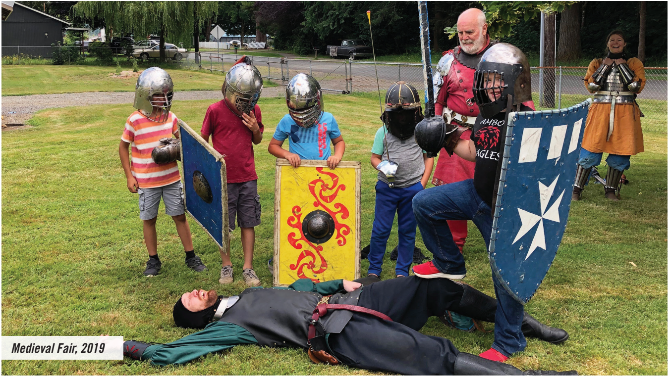
Medieval Fair, 2019