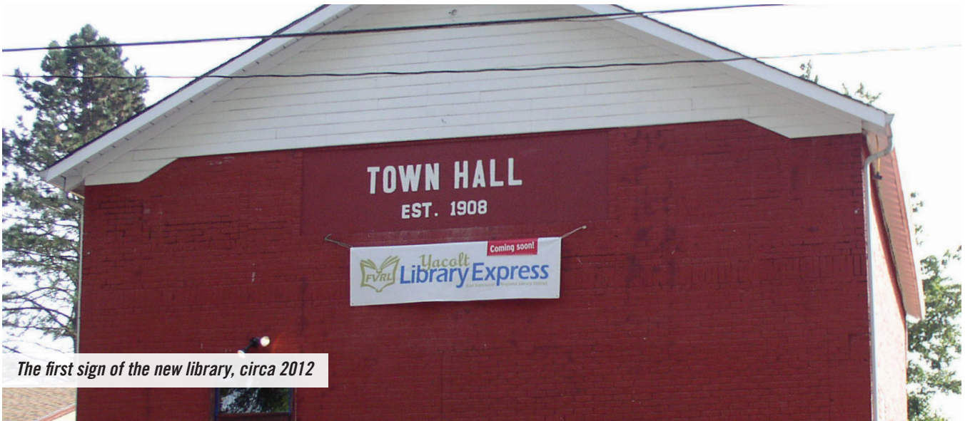
The first sign of the new library, circa 2012