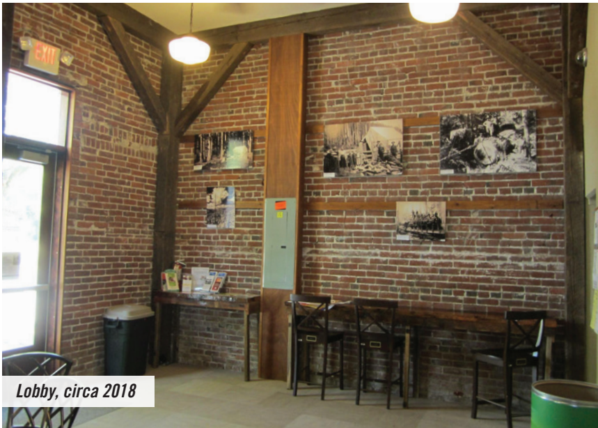
Lobby, circa 2018