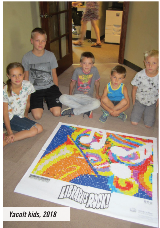
Yacolt kids, 2018