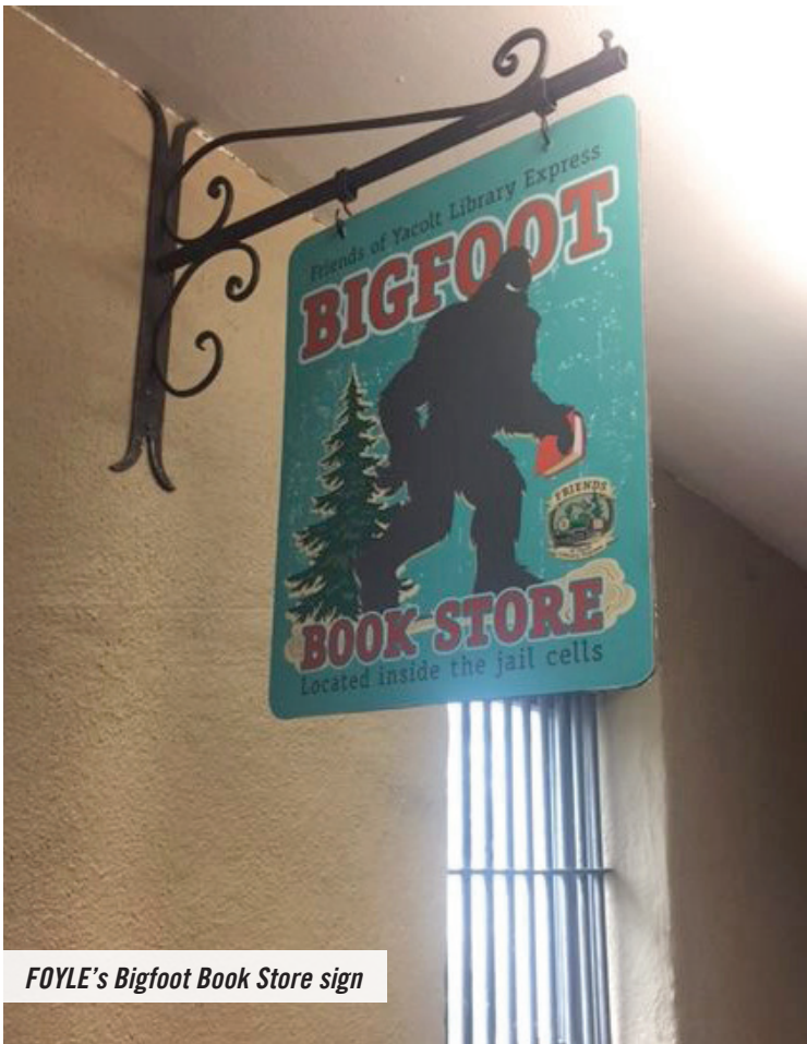
FOYLE's Bigfoot Book Store sign