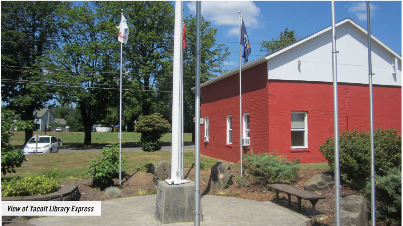
View of Yacolt Library Express