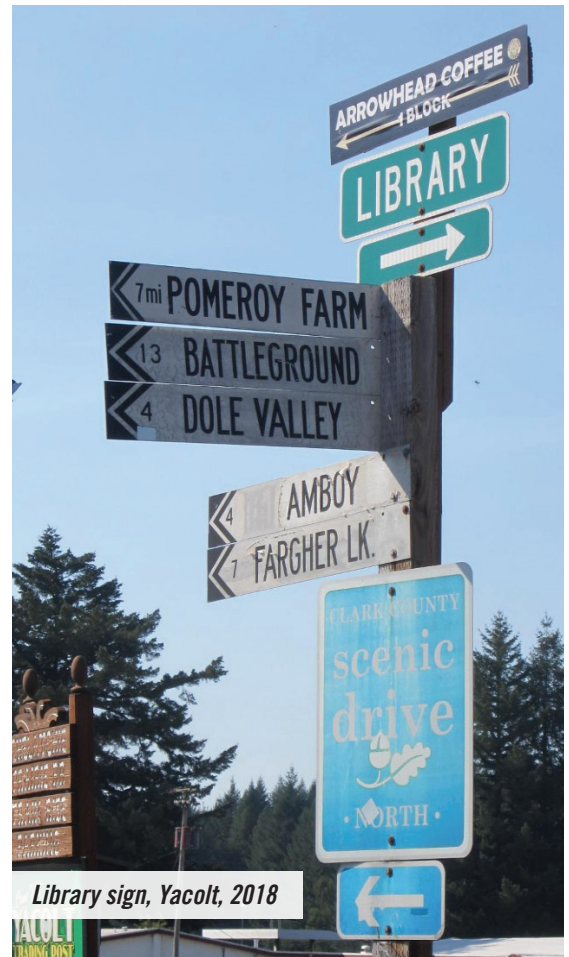
Library sign, Yacolt, 2018