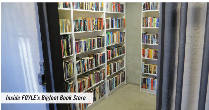
Inside FOYLE's Bigfoot Book Store